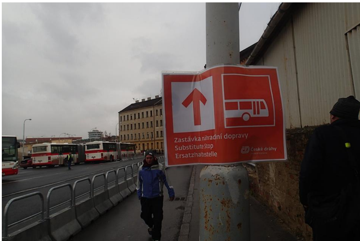
BUS STOP IS NOT FAR FROM THE DOLNI NADRAZI, WALK FOR SOME 300 METRES