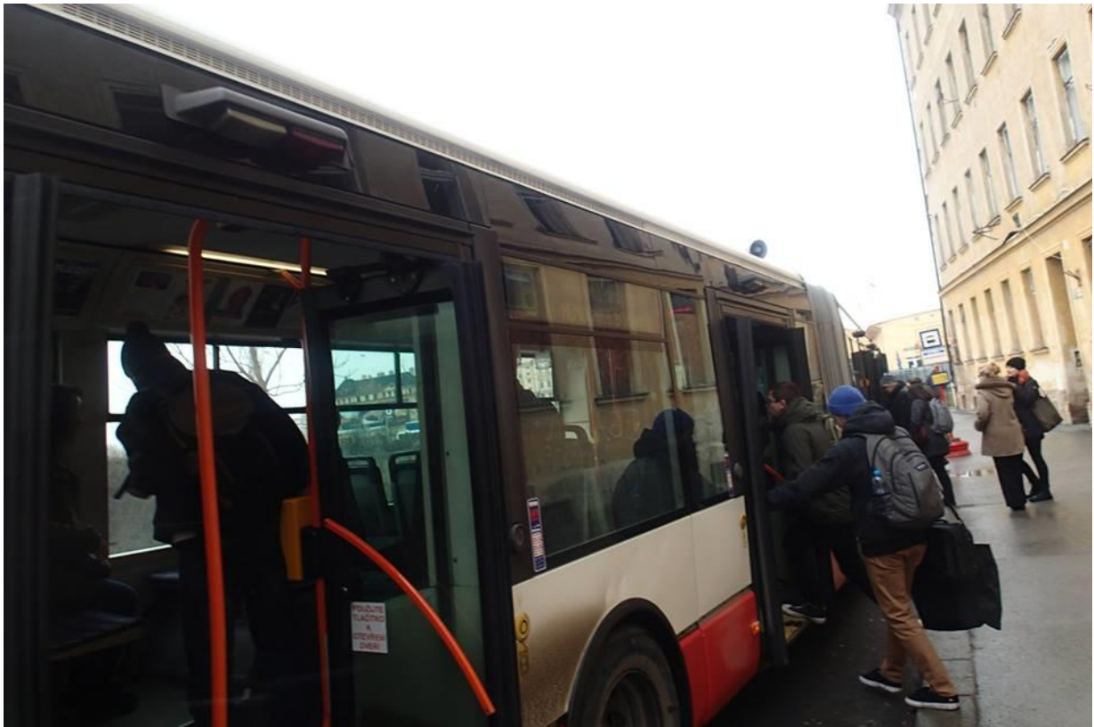
ALL ON BOARD