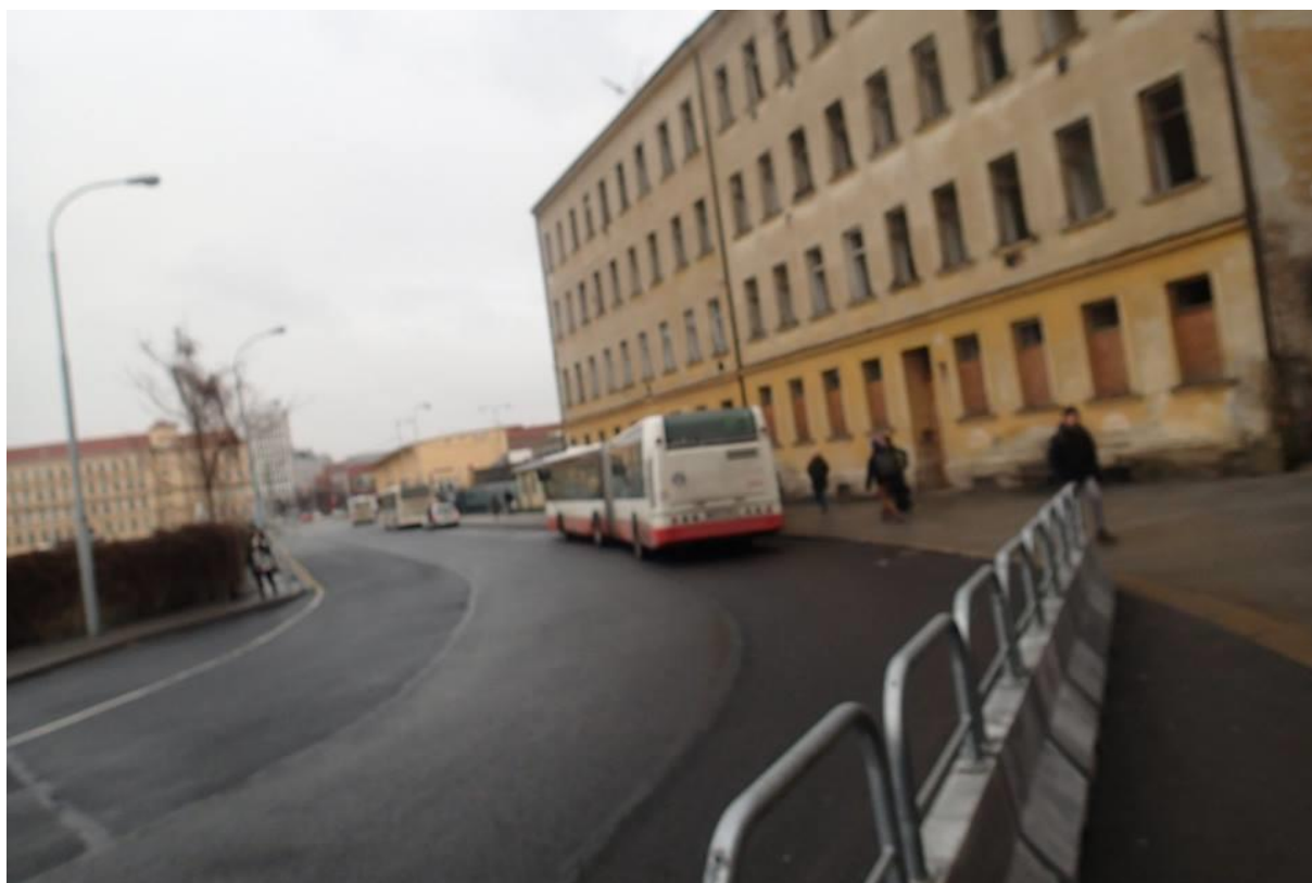
HURRY UP FOR THE BUS IS ARRIVING TO THE BUS STOP